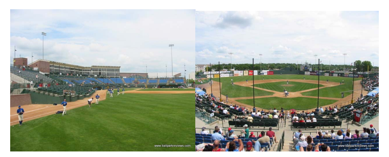
RONKEN FIELD – AUGUSTANA COLLEGE