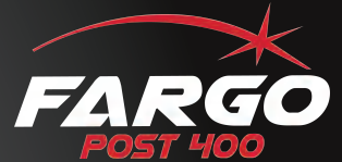
STARION BANK FIELD